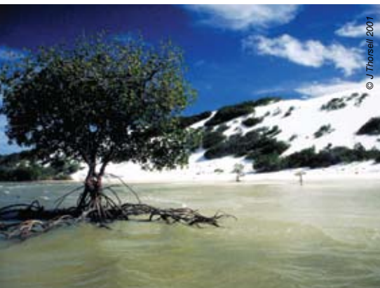
Shelburne Bay, Great Barrier Reef Heritage Area, Australia

Ecosystems contribute to reducing the risk of disasters in multiple and varied ways. Well-managed ecosystems can reduce the impact of many natural hazards, such as landslides, flooding, avalanches and storm surges. The extent to which an ecosystem will buffer against extreme events will depend on an ecosystem's health and the intensity of the event. Degraded ecosystems can sometimes still play a buffering role, although to a much lesser extent than fully functioning ecosystems