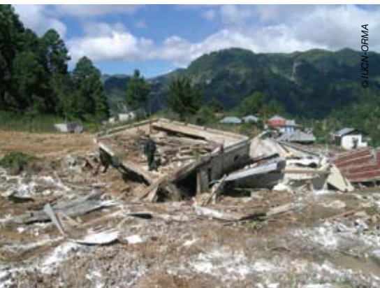
Post tropical storm Stan, Guatemala