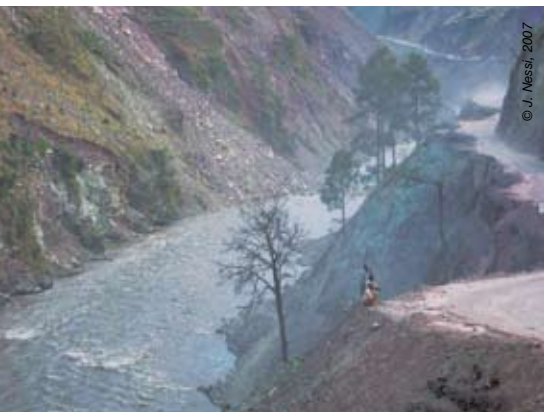
Pakistan earthquake and landslides, 2007

The Millennium Ecosystem Assessment (MA), a five-year international assessment initiative, clearly demonstrated the strong and varied links between human well-being, human security, livelihoods, health and intangible benefits such as equality and freedom of choice, with ecosystem services. The MA also highlighted that ecosystem degradation is undermining this link due to a number of human activities, mainly: