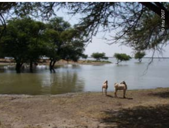
Flood in Shagarab, Eastern Sudan