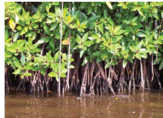
Mangroves, providing spawning grounds for numerous fish species, Sri Lanka

This is of particular relevance to the field of disaster risk management as it is a meeting point for enhanced livelihood security for the poor and long-term management of ecosystems. It is a strategy consistent with the Ecosystem Approach of the Convention on Biological Diversity, for the integrated management of land, water and living resources for human benefits as well as conservation goals (See Annex 1). Ecosystem-based DRR recognizes that ecosystems are not isolated but connected through the biodiversity, water, land, air and people that they constitute and support (Shepherd, 2008). Sustainable ecosystem management is based on equitable stakeholder involvement in land management decisions, land-use trade-offs and long-term goal setting. These are central elements to reducing underlying risk factors for disasters and climate change impacts 2 .