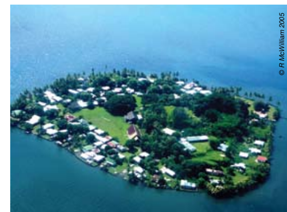
An island village, Fiji