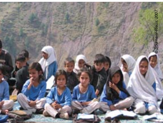
Open-air school, post-earthquake Pakistan