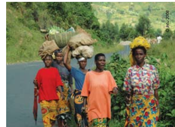
Women walking along the road to Bujumbura, Papua Indonesia

World Bank. 2004. "Natural Disasters: Counting the Cost" Press release, March 2, 2004. www.worldbank.org