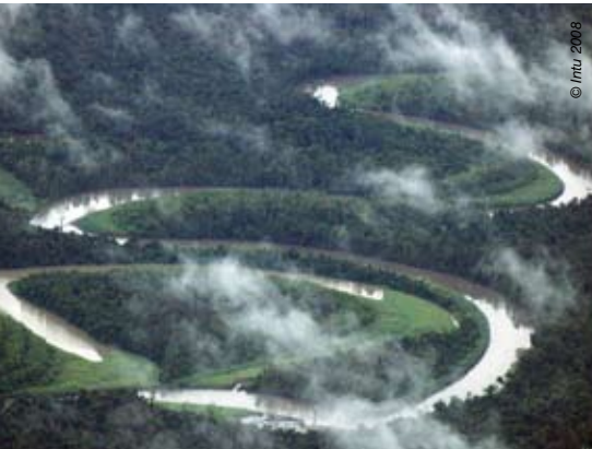
Mamberamo River, Papua Indonesia