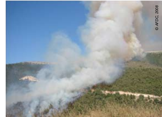
Forest fires, Andket, Akkar Lebanon

Fire is the main cause of forest loss in the northern Mediterranean, with considerable impact on properties and livelihoods. An average of over 400,000 ha is burnt each year, with a massive 751,798 ha burnt in 2003 alone. National strategies allocating major efforts and resources to fire fighting (i.e. buying of hydroplanes and helicopters) have proved to be inefficient in the light of the growing trend of large-scale devastating fires. An integrated fire management strategy should be based on a risk reduction management framework aiming to increase ecological and social resilience to adapt to the complex interrelation between the predicted increase of heat waves and the human-induced impacts on natural ecosystems.