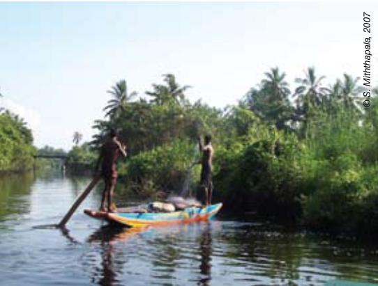
Fishermen, Muthujarawela Marsh, Sri Lanka