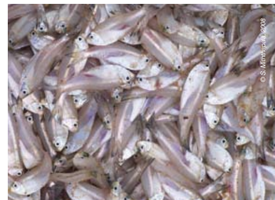
Sprats, Sri Lanka