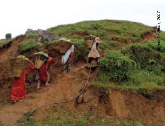
Women bringing cabbages to market, Nepal