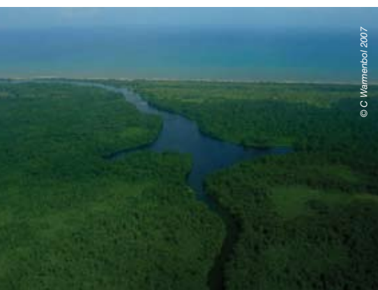
El Cangrejal river, Honduras