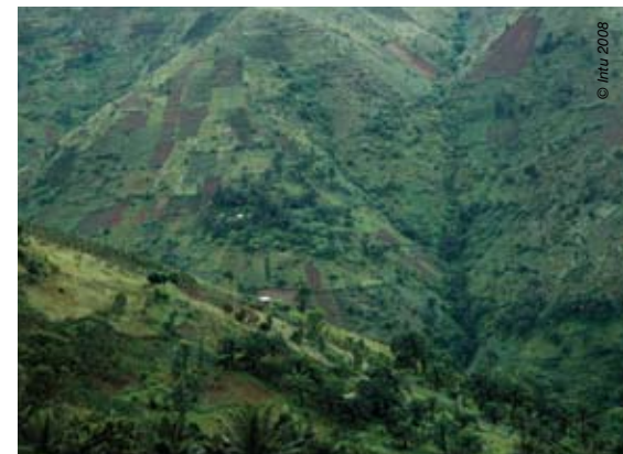
Bururi Province, Burundi